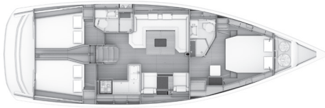
Version A Forward cabin, 2 aft cabins / 2 heads