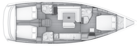
Version B Forward cabin, 2 aft cabins / 3 heads