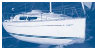
Sun Odyssey 30i