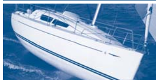
Sun Odyssey 30i Performance