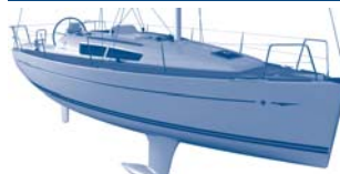
Sun Odyssey 33i