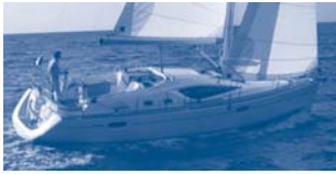
Sun Odyssey 39 DS