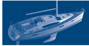
Sun Odyssey 42 DS