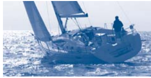
Sun Odyssey 39 DS Performance