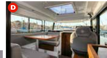
The bench seating at the salon table can be adjust to face forward while underway and converts to additional berth

Generator Pushed air heating system 2 aft cockpit worklights 1 front cockpit worklights Underwater lights Teak on cockpit floor Teak on side deck Removable exterior carpet set LEGEND VERSION : Navy blue hull