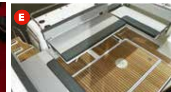
Sliding aft bench seat with a high back can move forward allowing for the engines to be raised up