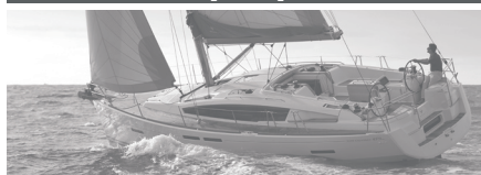
Sun Odyssey 41 DS