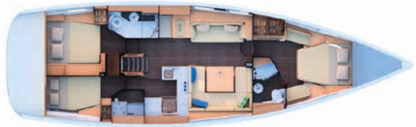
3 cabins version : 2 heads with storage and utility rooms