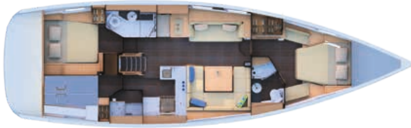
2 cabins version : 2 heads with storage and utility rooms