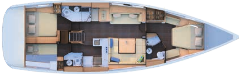
2 cabins version : 3 heads with skipper cabin