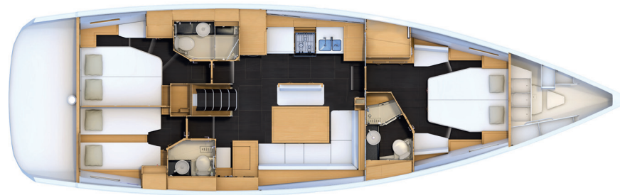
3 cabins version: Forward owner's cabin, VIP aft cabin, aft guest cabin (optional saloon bench)