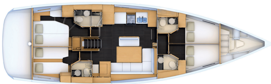
4 cabins version: Two transformable cabins forward, VIP aft cabin, aft guest cabin (optional saloon bench)