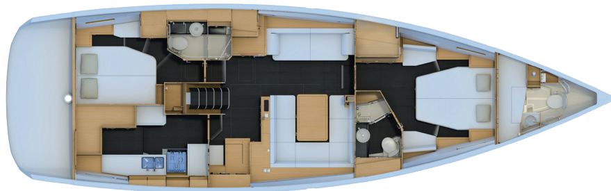
2 cabins version: Forward owner's cabin, VIP aft cabin, full saloon and aft galley (shown with optional skipper cabin)