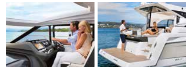
▶ LEADER 46 LEADER