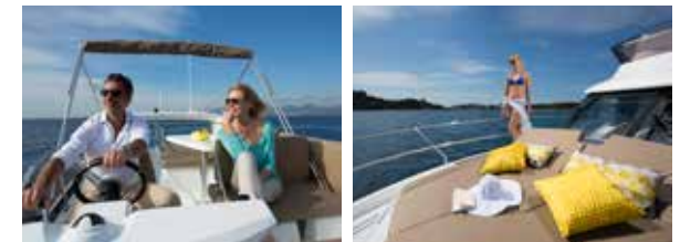
▶ VELASCO 37F VELASCO